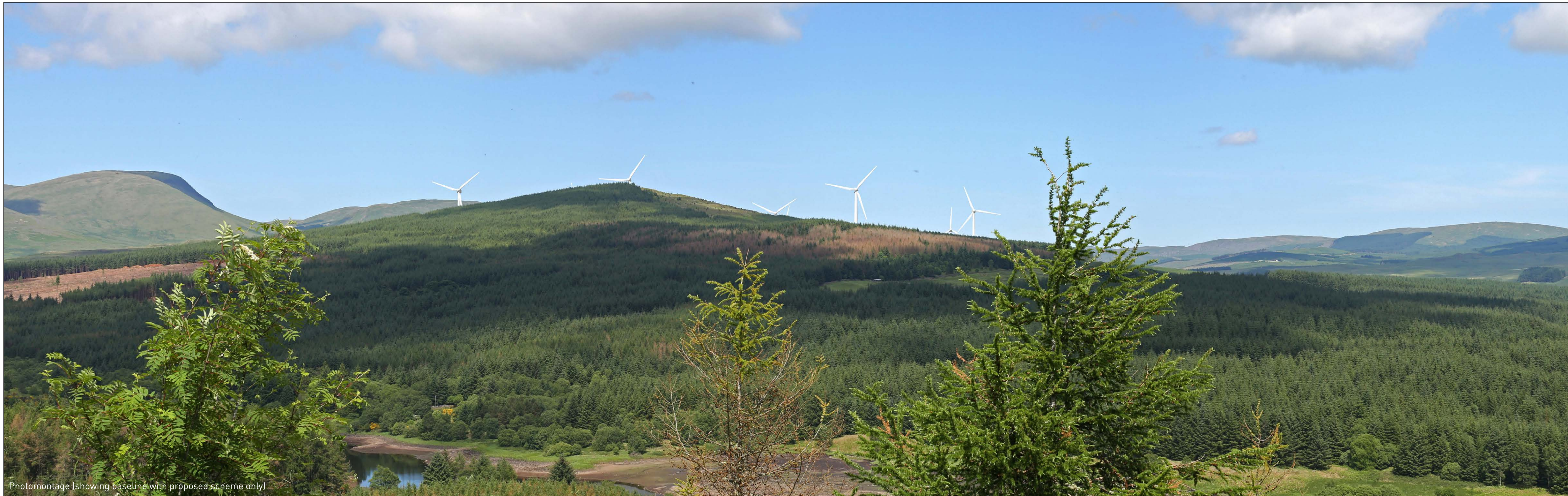
Photomontage [showing baseline with proposed scheme only]